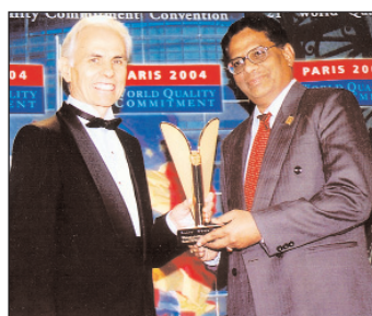
World Quality Commitment Award