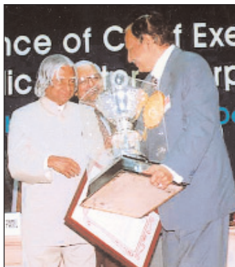
SCOPE Award for turnaround