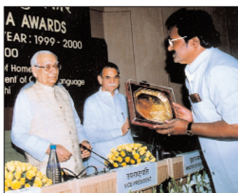
Indira Gandhi Rajbhasha Award

The Company also recognizes the talents within the Company and encourages its employees to actively participate and give suggestions for improvement in the performance of the Company.