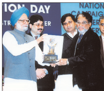
Special prize for getting first prize for three consecutive years 2003, 2003 & 2004

During the year 2003, a team from Bhilai Steel Plant consisting of five employees bagged the prestigious Prime Minister's Shram Ratna Award - the highest award in this category. In addition to this, another team from Bhilai and one employee from Bokaro Steel Plant have bagged the Shram Vir award for the year 2003.